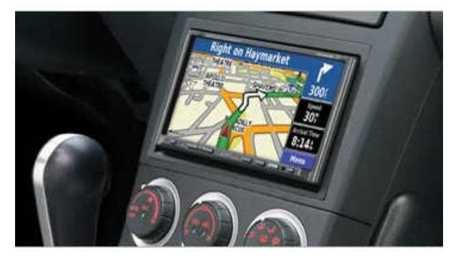
Figure 4: Front panel of car navigation system

Figure 5: Integrated navigation system using audio